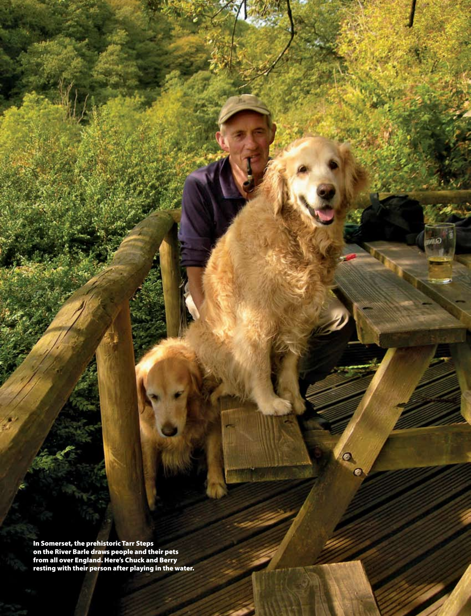
In Somerset, the prehistoric Tarr Steps on the River Barle draws people and their pets from all over England. Here's Chuck and Berry resting with their person after playing in the water.